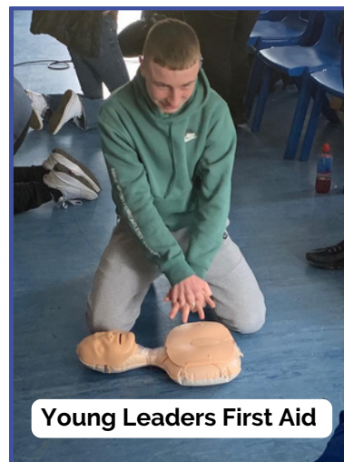
Young Leaders First Aid

This training was also offered out to our providers and community groups, and so far, has certified over 90 people in Emergency First Aid at work, which supports their ongoing work in the community with extra piece of mind in having their own first-aid trained staff and volunteers.