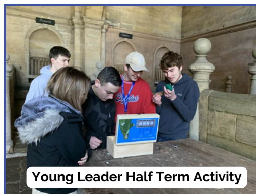
Young Leader Half Term Activity

The staff and volunteers were very impressed with all the knowledge the Leaders picked up during their time and commented on the great smaller details they had picked up about the Hall and the family – which typically takes volunteers years to host a tour themselves!