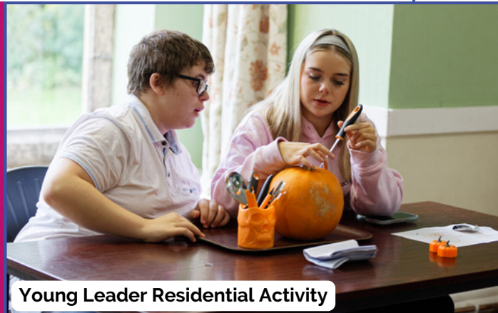
Young Leader Residential Activity