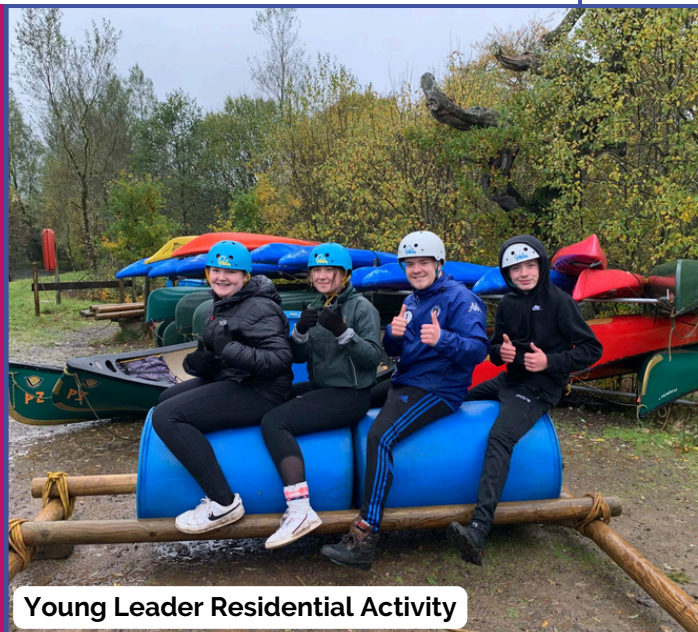
Young Leader Residential Activity

Ensuring our young people can co-create, engage, inspire and develop their skills in a safe enjoyable environment, whilst making memories for a lifetime