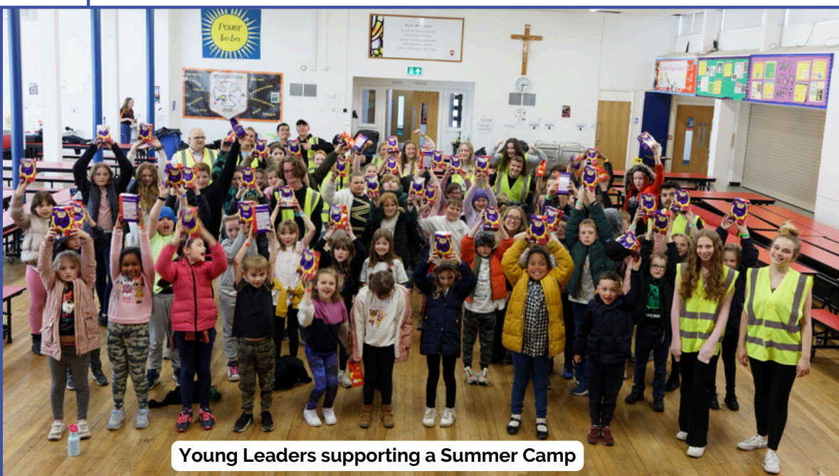
Young Leaders supporting a Summer Camp

Over the last 3 years Young Leaders have given up of 12096 hours of their time to support HAF summer camps alone! They chose to give up their summer holidays and support the camps in their areas.