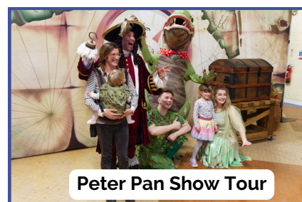
Peter Pan Show Tour

Our most recent workbook was to support the 'Justin-Credible Super Show' tour over winter. This workbook incorporated all the characters involved in the show promoting a healthy lifestyle, exercise and games with an additional 16 hours of activities to complete at home - which also led into our partnership working with oral health. All children who attended received a workbook and a teeth cleaning pack which included toothbrushes, toothpaste and a 'teeth timer' so children were able to learn about taking care of their teeth. We were able to supply 500 packs to children and their families.