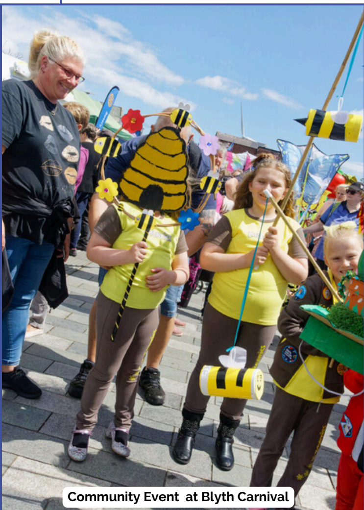
Community Event at Blyth Carnival