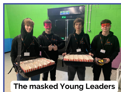
The masked Young Leaders