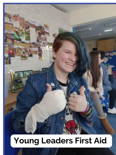
Young Leaders First Aid