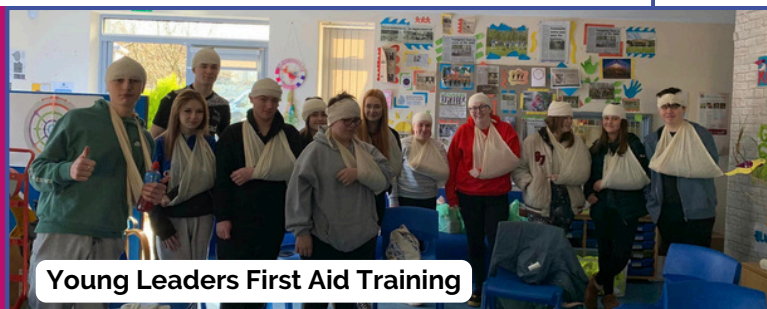
Young Leaders First Aid Training

Our Young Leaders all embark on training as a key part of their experience with us.