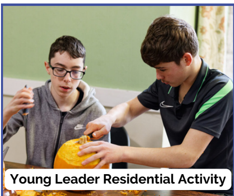
Young Leader Residential Activity

Residential s are a key part of the Young Leader journey and we have facilitated 7 such events, all of which were either 4 or 5 day events.