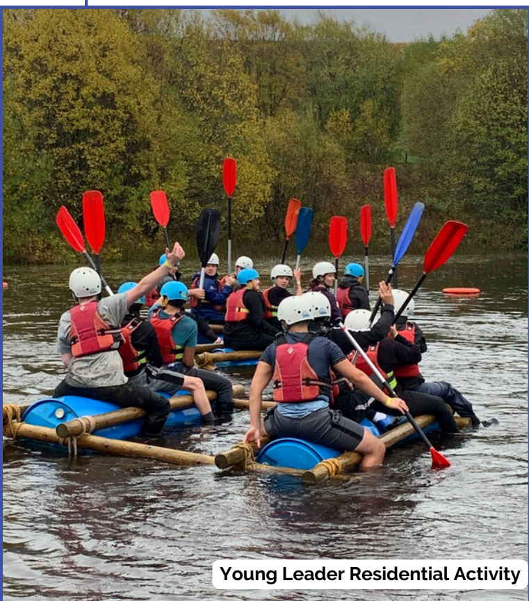
Young Leader Residential Activity

Working closely with Northumberland County Council, Citizens Advice Northumberland, Thriving Together to work on key elements of strategy and development on projects across the area, Leading Link were thrilled to be working with the North East Child Poverty Trust over the last 3 years and they look forward to working with them again on other new, innovative and rewarding projects.