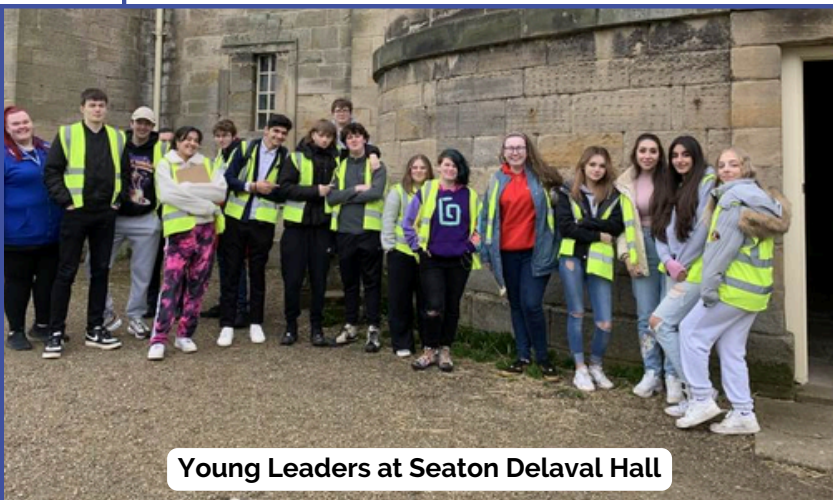
Young Leaders at Seaton Delaval Hall