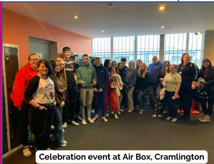
Celebration event at Air Box, Cramlington

Celebrating achievements is key to a healthy life.