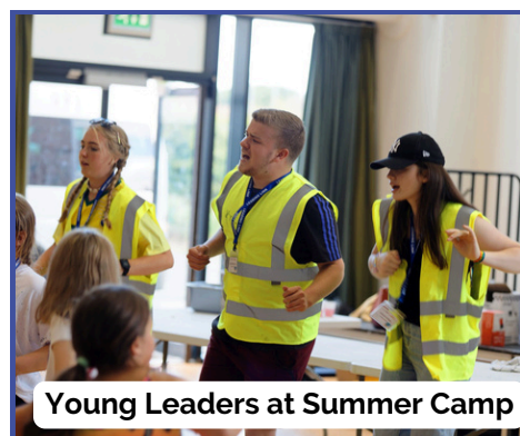
Young Leaders at Summer Camp

"I overcame my fear of being in front of a camera', 'I learnt that it was best to do a script because if you adlib it tends to go off track".