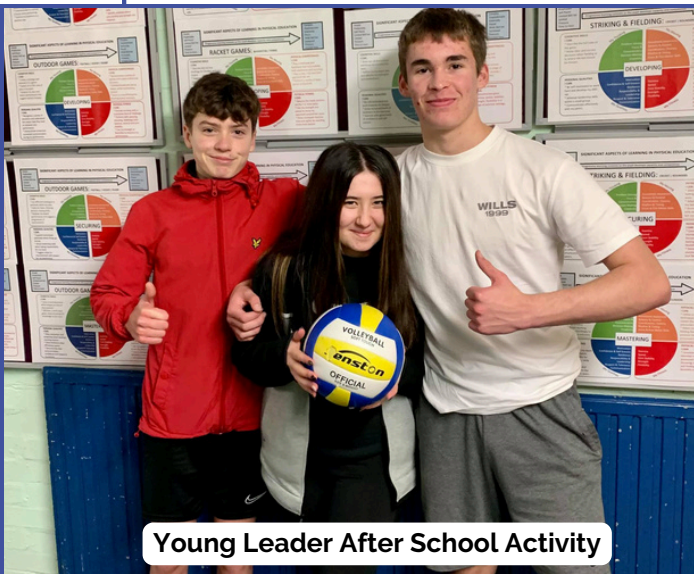
Young Leader After School Activity