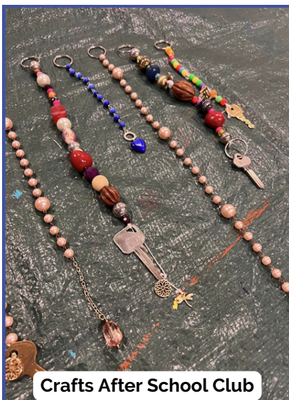
Crafts After School Club

Following some working sessions with our Young Leaders it became clear that they wanted to take some responsibility and co-create their own activities and they felt they wanted to be able to this, small scale in their own schools or feeder schools in their area. We met with the Leaders in their own schools and following agreements with key personnel in those schools, embarked on a series of After School Clubs.