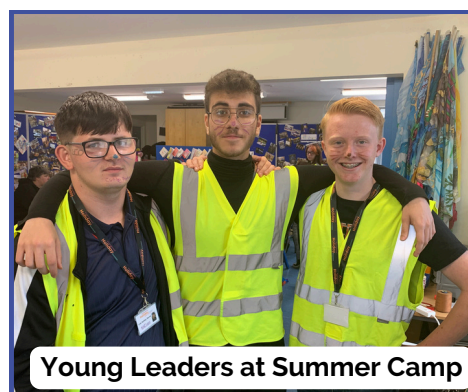
Young Leaders at Summer Camp