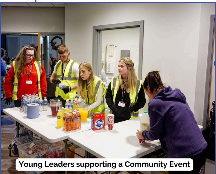
Young Leaders supporting a Community Event