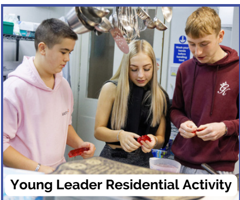
Young Leader Residential Activity