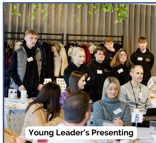
Young Leader's Presenting