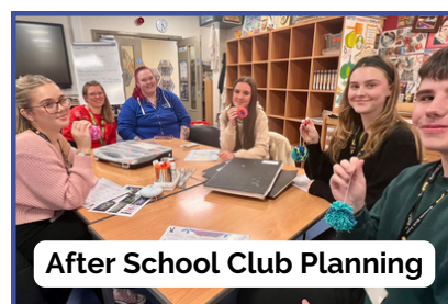
After School Club Planning

In total there 29 weeks of term time after schools clubs engaging in 588 hours of activity for the children attending them.