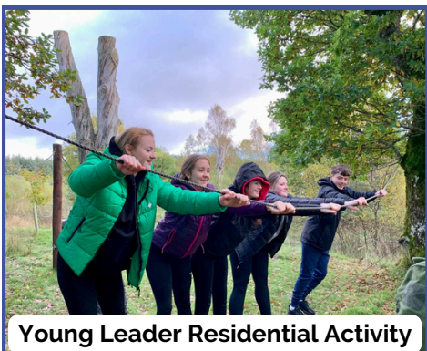
Young Leader Residential Activity