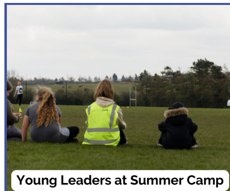
Young Leaders at Summer Camp

The video has been used during school assemblies to promote the programme and also used at various meetings, pop ups and workshops to showcase their young peoples commitment and development, together with their increased skillset.