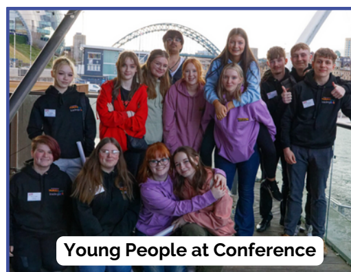
Young People at Conference