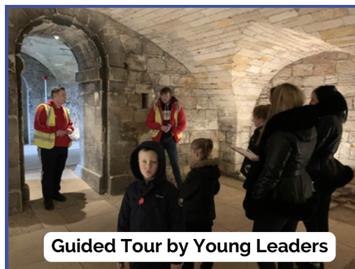
Guided Tour by Young Leaders