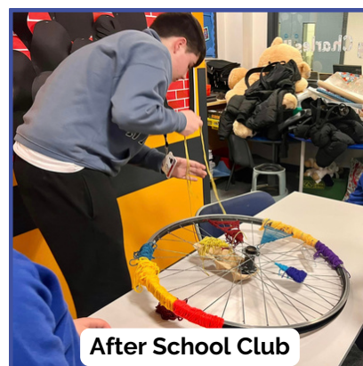
After School Club

In Wallsend 6 Young Leaders ran Glow Up Sports sessions. They created this idea to encourage some of those who were disengaged in PE because of fears of performance, body issue and peer pressure could enjoy and engage with if they felt less self conscious. They ran a 6 week session of mixed ability dodge ball, volleyball and football - but in the dark! UV lights were used and all taking part wore UV Jackets, head gear and arm bands - this was great fun and engaged with over 30 children on each session.