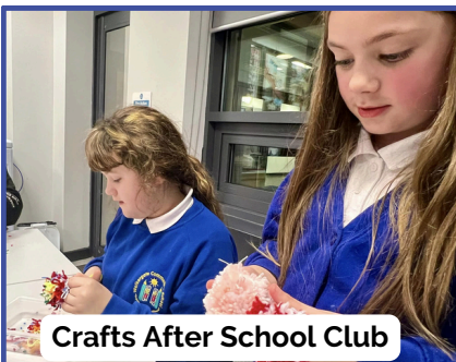
Crafts After School Club