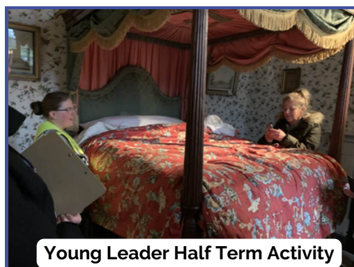
Young Leader Half Term Activity