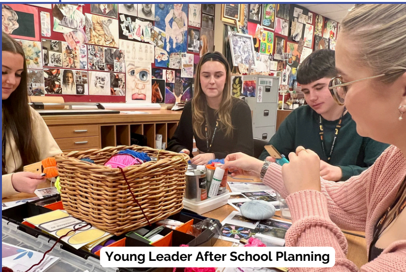
Young Leader After School Planning