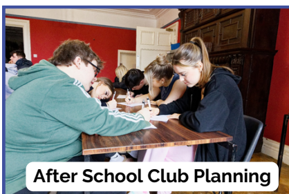
After School Club Planning

Designed by Young Leaders for primary and secondary children in their own schools